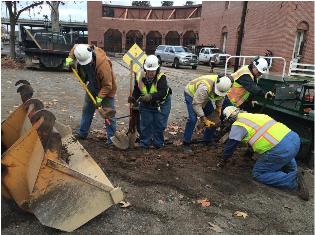
The Team puts their backs into it...