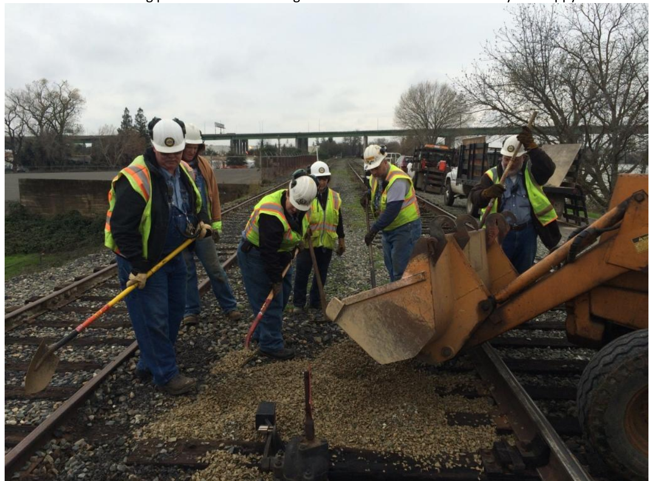
The crew is one well oiled machine (that doesn't break down...)